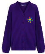
Cardigan School Uniform