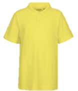
Yellow Polo Shirt PE Kit