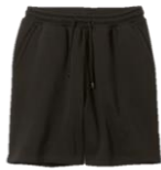
Black Shorts PE Kit