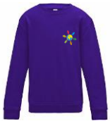
Jumper School Uniform