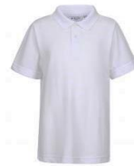
White Polo Shirt School Uniform